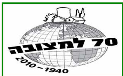
MATZUVA'S 70th YEAR