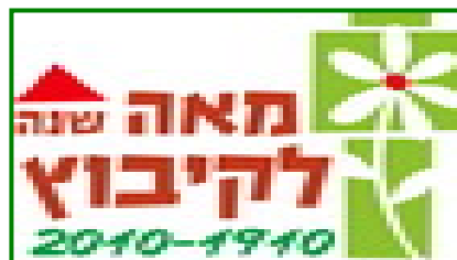
100 YEARS OF THE KIBBUTZ MOVEMENT