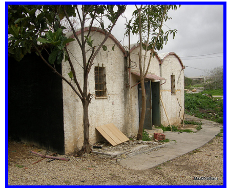
Postcard of the old Miflat Pub