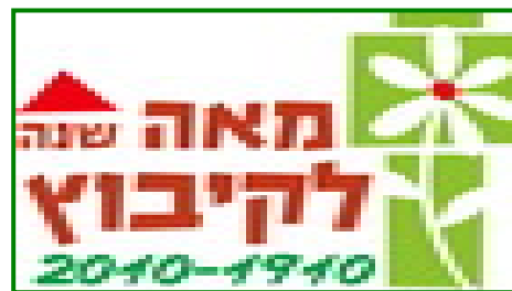
101 YEARS OF THE KIBBUTZ MOVEMENT