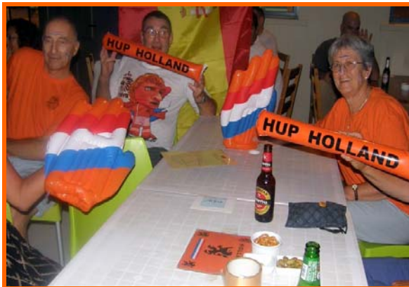
SOME OF THE SOBER HOLLAND SUPPORTERS

Meanwhile, the obvious bias for Holland was evident at Matzuva during the World Cup (Mondial). Amir, one of our newer members owns the Norte pizza bar (in the reconverted "Matzuva Laundry" and used the month of football to set up a large screen opposite the bar covering the building opposite next to the old bus stop. Members and also our agricultural workers from Thailand would arrive to view games on the big screen while downing beers and eating pizzas served on the terrace of the bar. Despite all the bias it didn't help and as we all know it was Spain that lifted the cup.