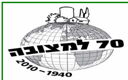
MATZUVA'S 70th YEAR