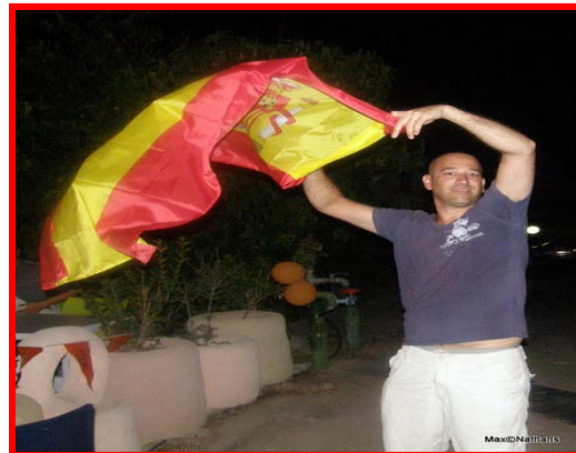
A LONE MATZUVA 'SPANIARD' RUBBING IT IN !!