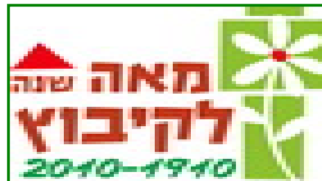
100 YEARS OF THE KIBBUTZ MOVEMENT