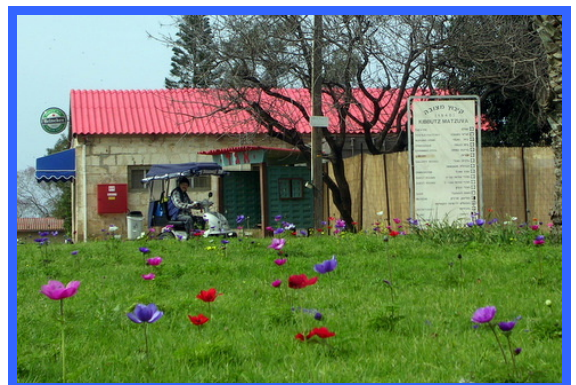
THE MATZUVA WE ALL KNOW TODAY