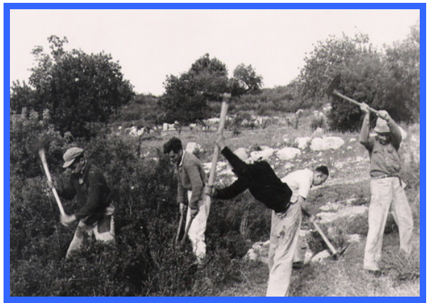
FIRST DAYS: HARD PHYSICAL WORK ON THE VIRGIN LAND AT MATZUVA