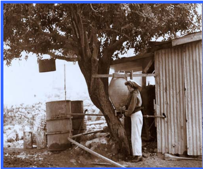
FIRST DAYS: THE WATER URN (WATER BROUGHT IN BY TRUCK FROM NAHARIYA