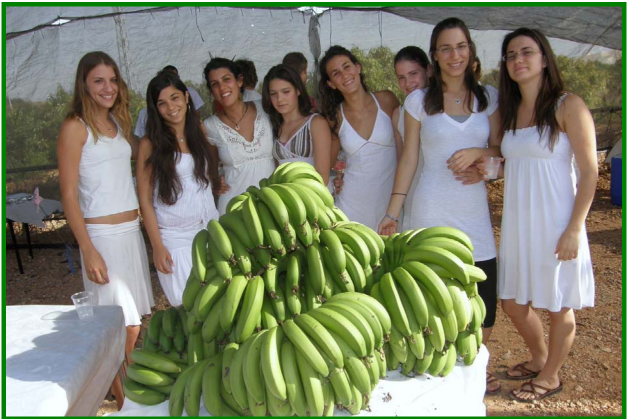
YOUNG LADIES OF MATZUVA TODAY