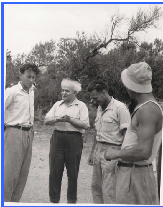
DAVID BEN-GURION AT MATZUVA 1947 WARNING THEM OF IMPENDING ISRAELI WAR OF INDEPENDENCE