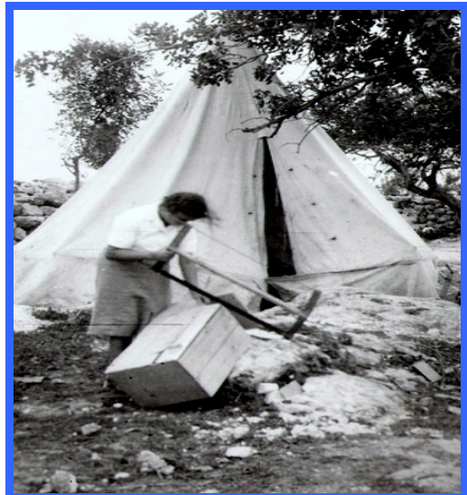
FIRST DAYS: HOUSING WAS VERY BASIC DURING THE FIRST FEW YEARS AT MATZUVA