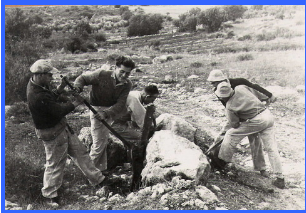
FIRST DAYS: CLEARING ROCKS ON THE MATZUVA HILL